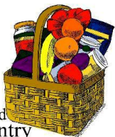
Food Pantry Ministry

May 3rd is "Two-Can Sunday" but donations are always welcome. Items may be left in the baskets near the church entries or at the church office. There are envelopes on the bulletin board in the main hallway for monetary donations and ideas for needed items.