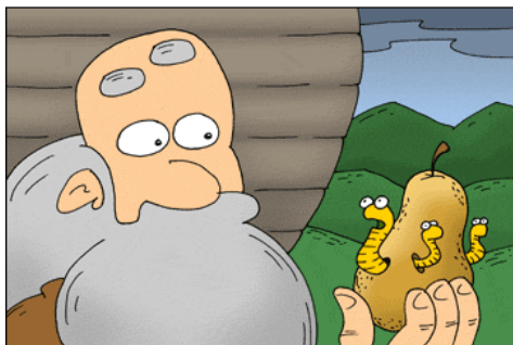
WE WERE TOLD YOU WERE TAKING CREATURES THAT CAME TO YOU IN PEARS

Susan.brosnan@gmail.com and you may see your message in the next Little Pilgrim .